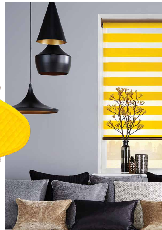
Capri Colour Ochre