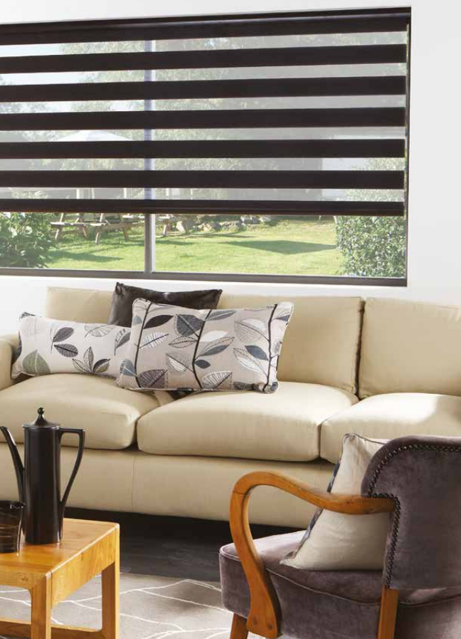
Open | Translucent - Opaque