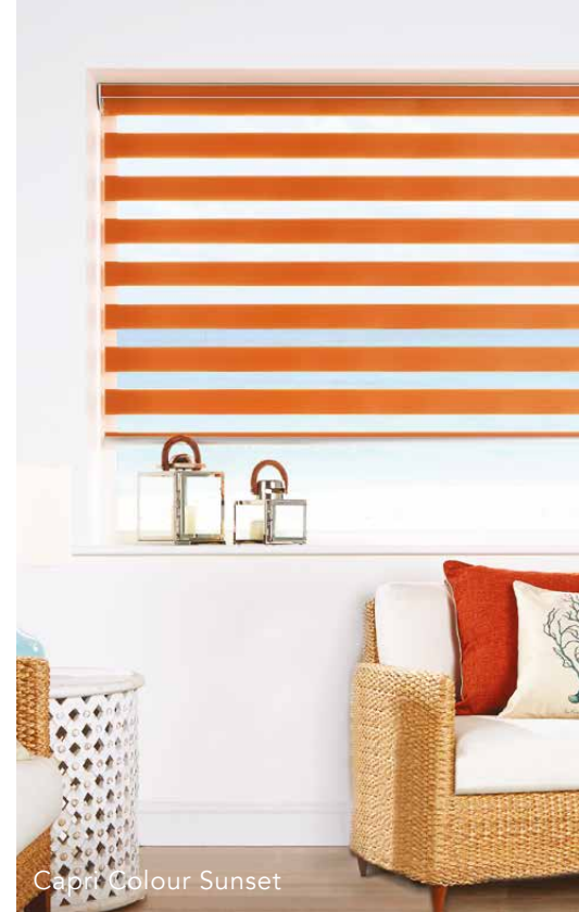
Capri Colour Sunset