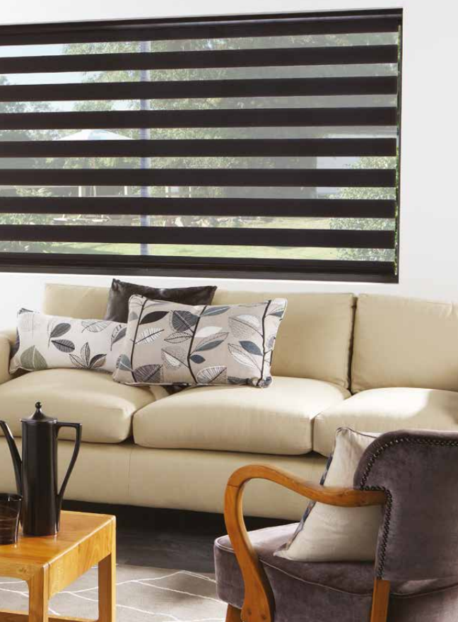
Closed | Translucent - Opaque