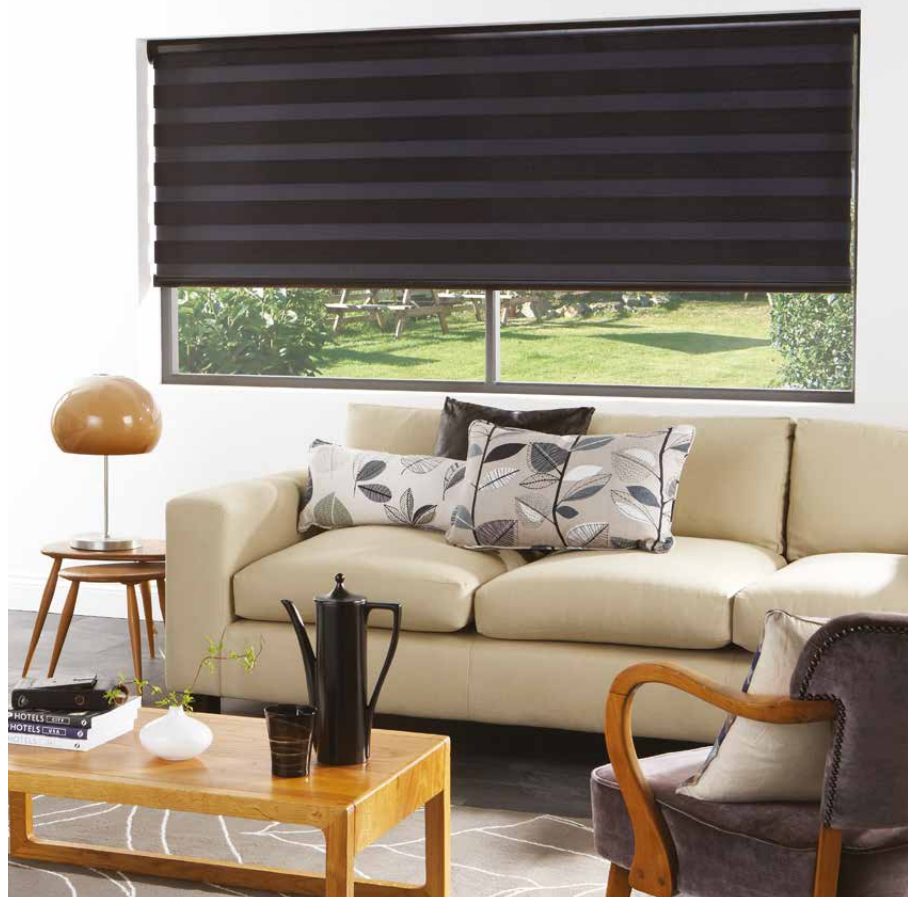
Partially Open | Opaque - Opaque